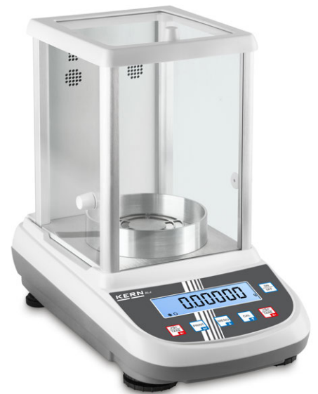
1 KERN ALJ 200-5DA with optional ionisor 2, see Accessories

Analytical balance range with large weighing capacities – now also with EC type approval [M] or available as semi-micro analytical balance